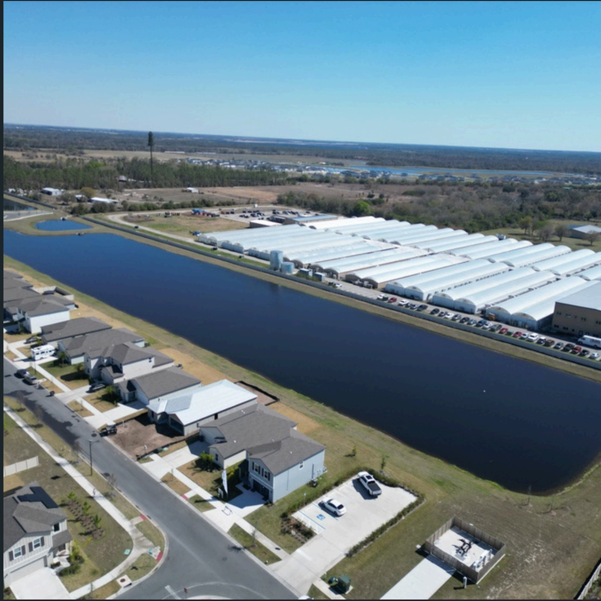
Pond #1 Treated for Shoreline Vegetation.