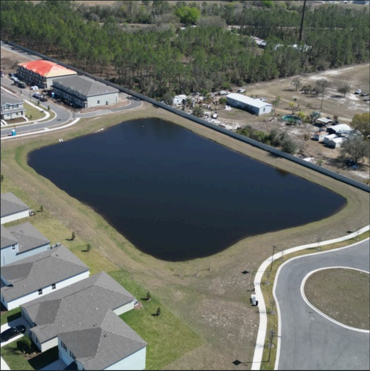
Pond #2 Treated for Shoreline Vegetation.