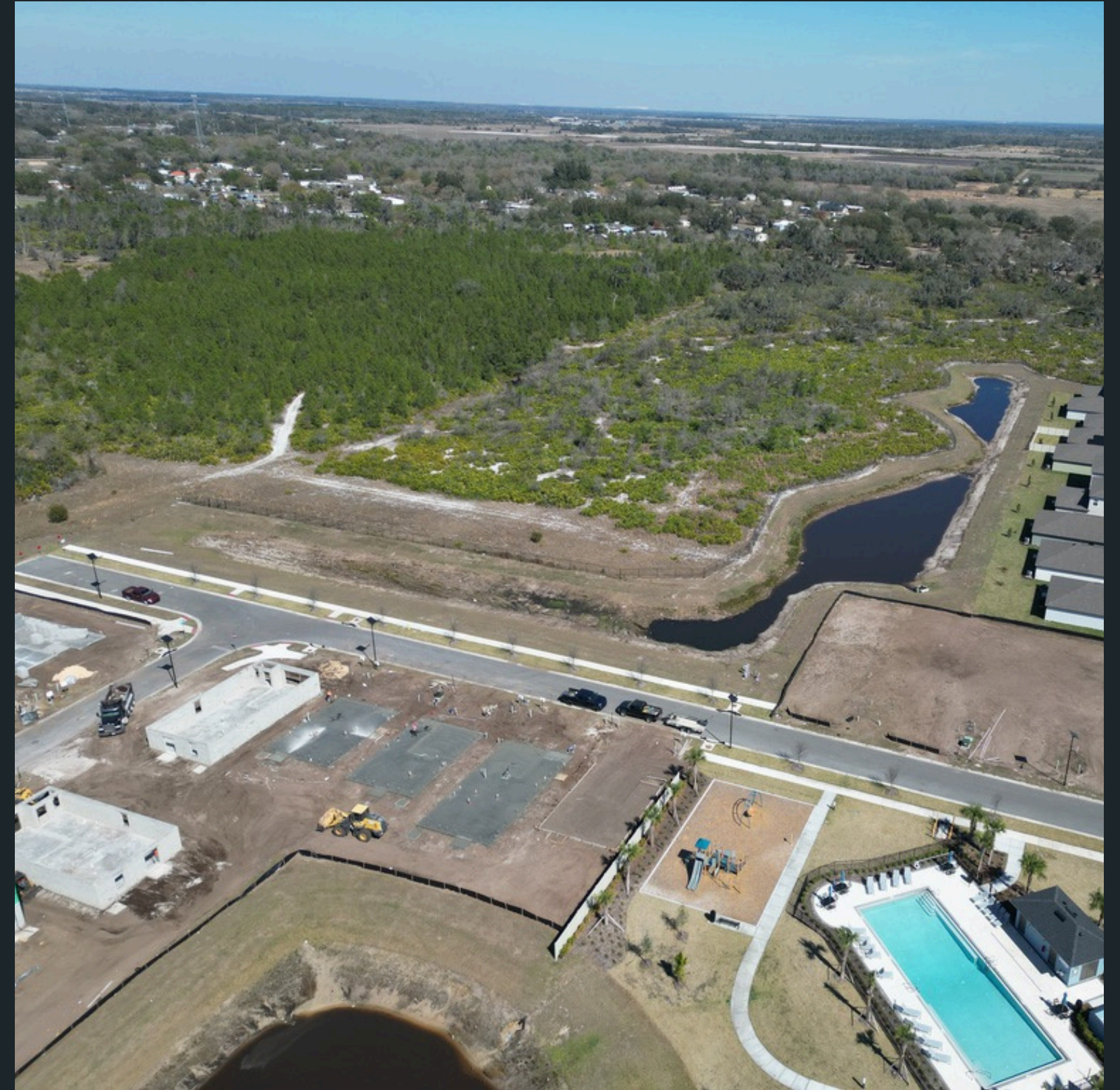
Pond #S2 Treated for Shoreline Vegetation.