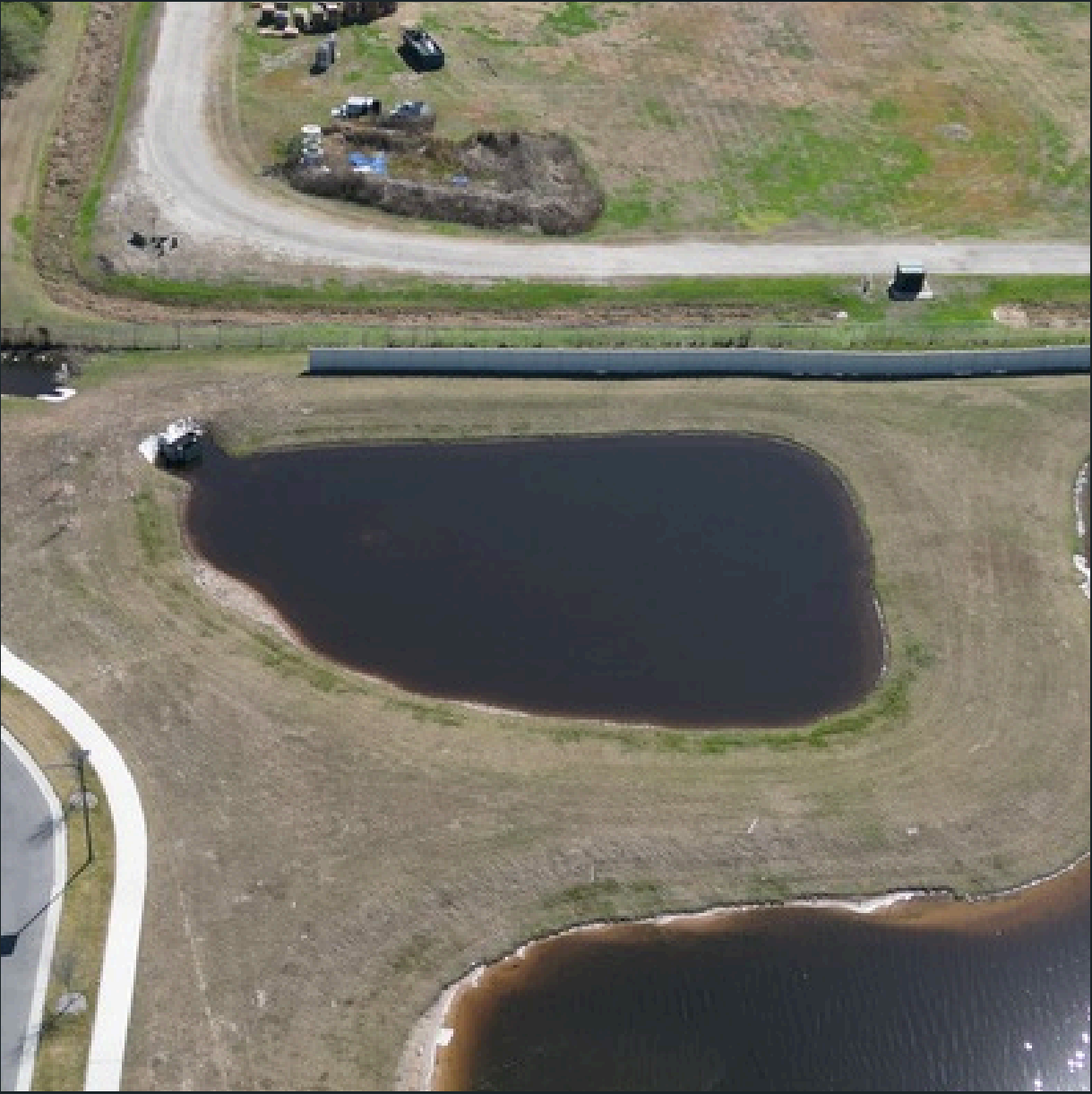
Pond #S1 Treated for Shoreline Vegetation.